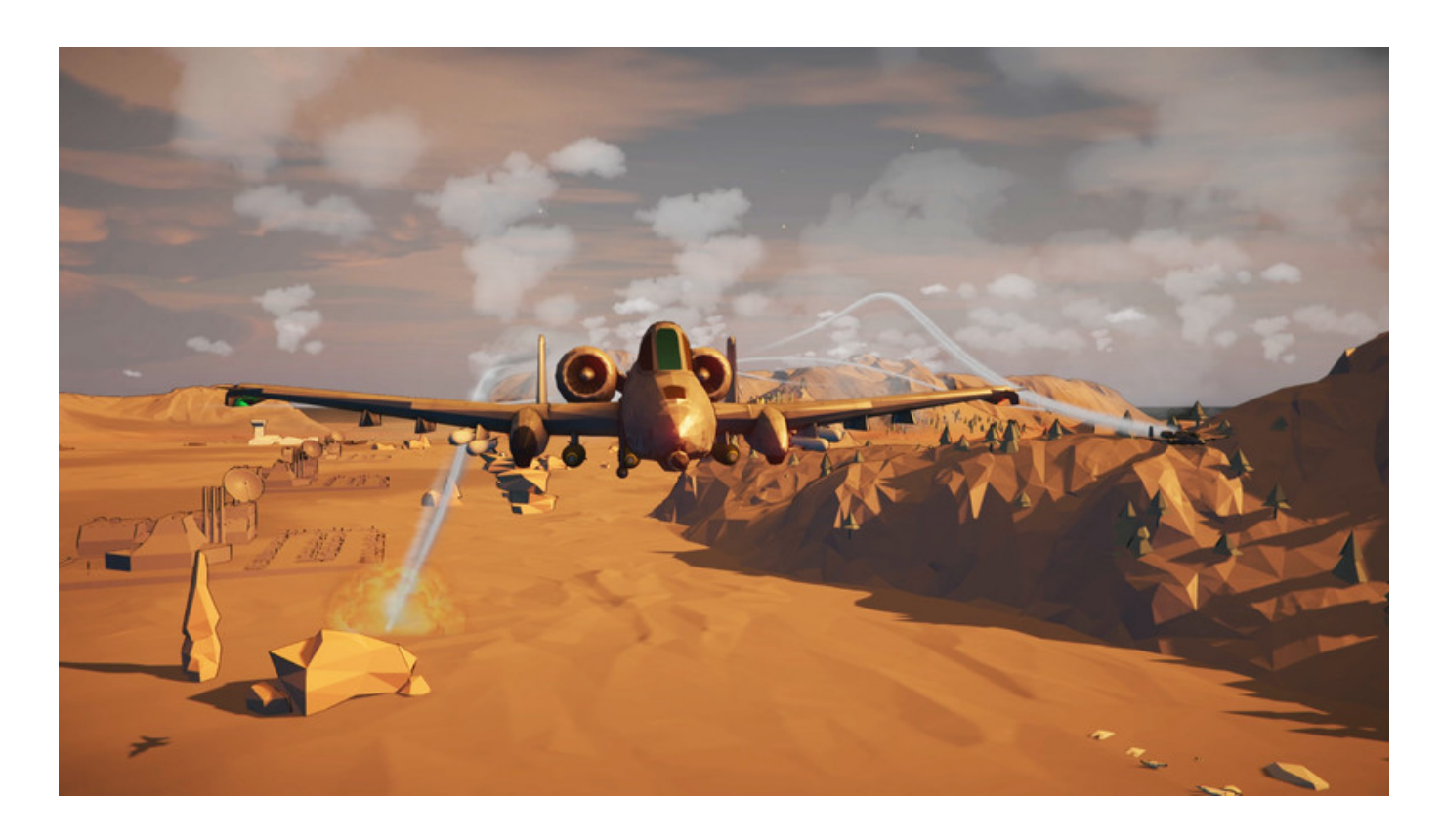
SONAR - A Virtual Reality Experience Activation Key Crack